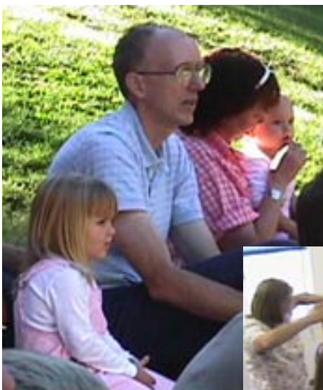
Family bonding at Mt. Cross Camp