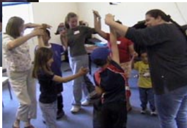
Faithful Help One Child volunteers make all the events fun for the kids.