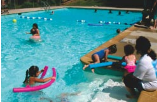
Families relax in the camp pool.

Help One Child foster families spent a weekend of camp fun with meals prepared for them on Father's Day weekend. 26 Adults and 44 children enjoyed swimming, hiking, creek-walking, games, crafts and campfires at Mt Cross near Felton. Nine families stayed overnight in cabins Friday & Saturday and other families came to camp for the Saturday afternoon picnic. College age camp counselors organized activities and supervised children. Families remarked that it was freeing to have the camp to themselves, to be able to relax and to let the children play with each other and the counselors. For some it is rare to have a family weekend away.